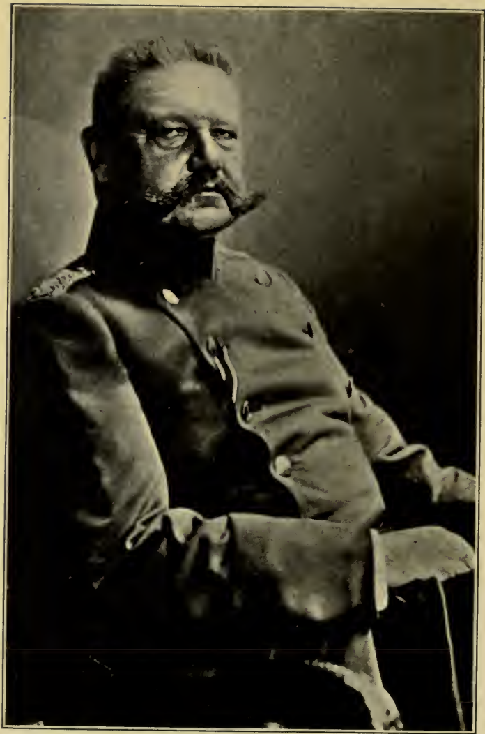
FIELD-MARSHAL VON HINDENBURG